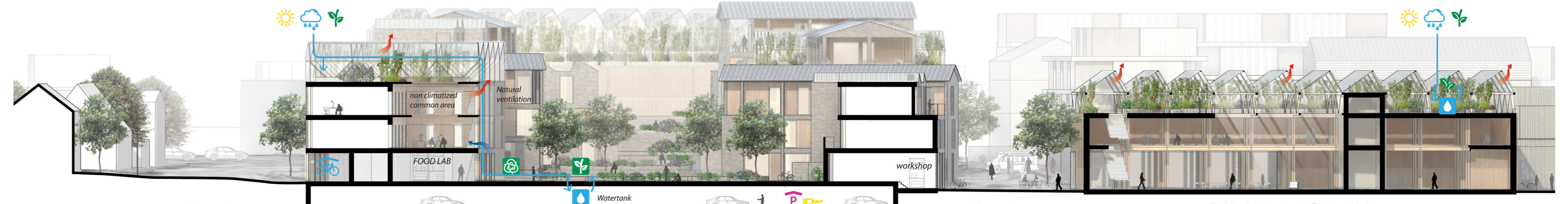
SECTION BB 1:300