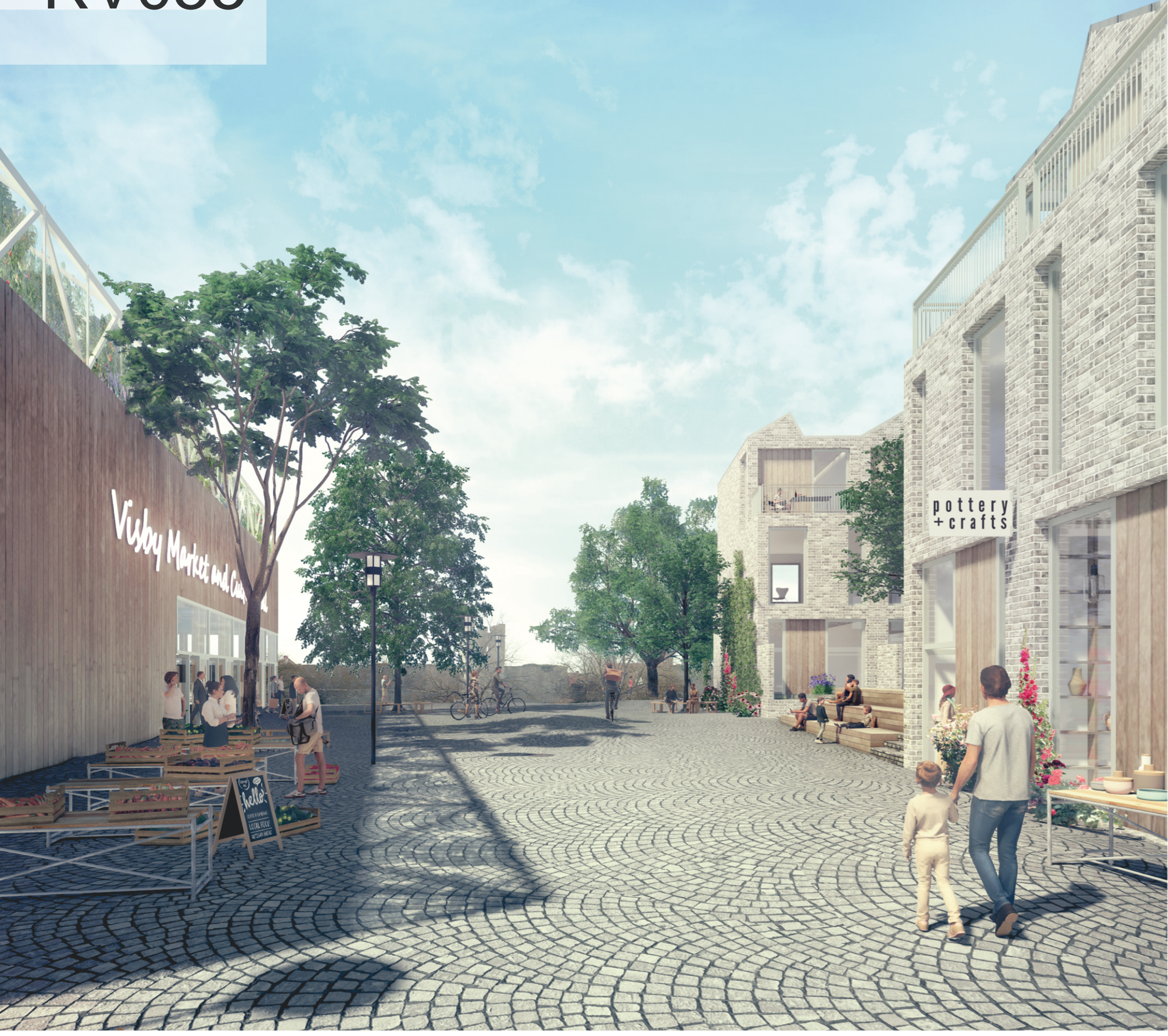
VIEW FROM IHREGATAN TOWARDS THE HISTORICAL CITY WALL