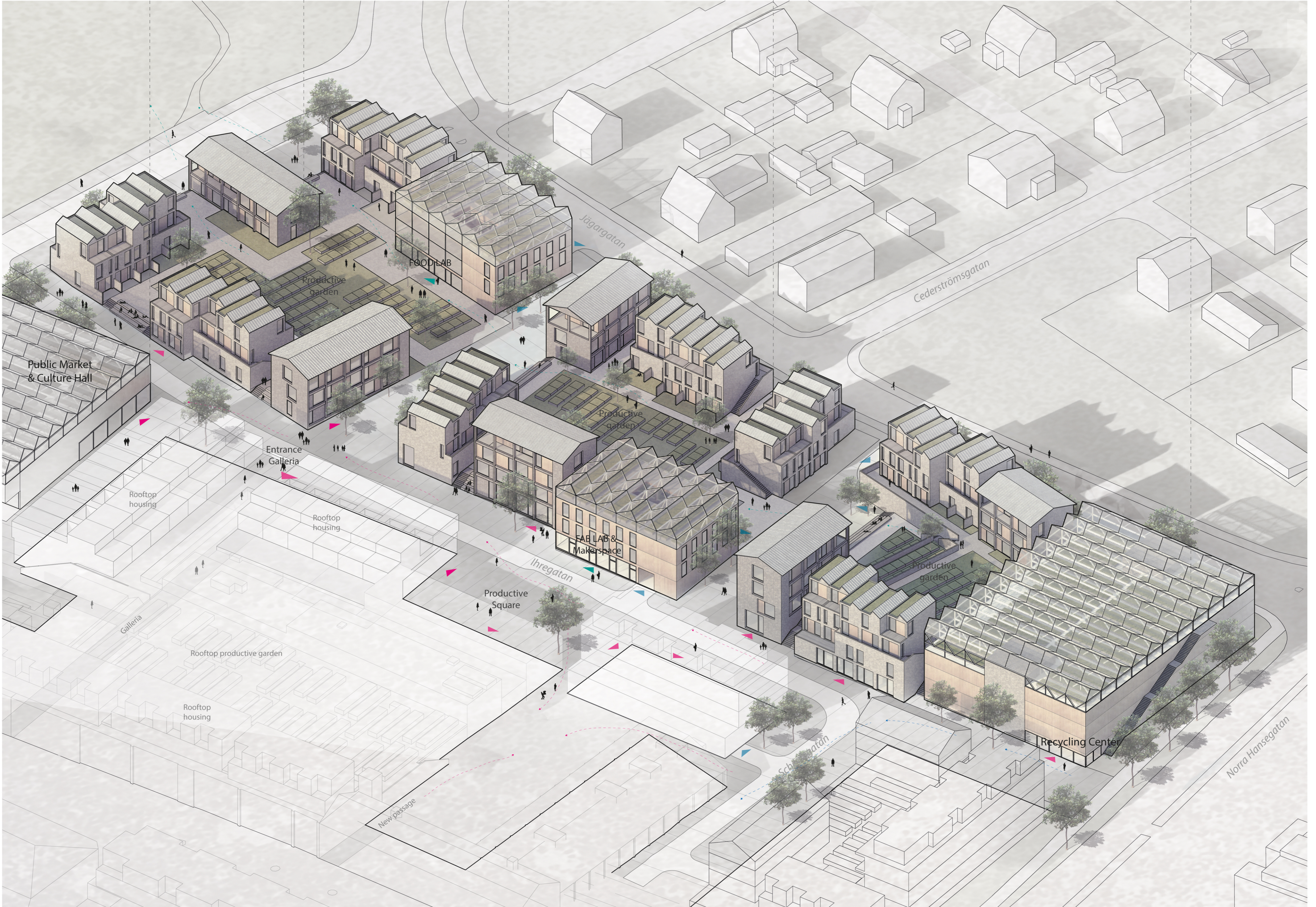
ISOMETRICAL PLAN 1:500