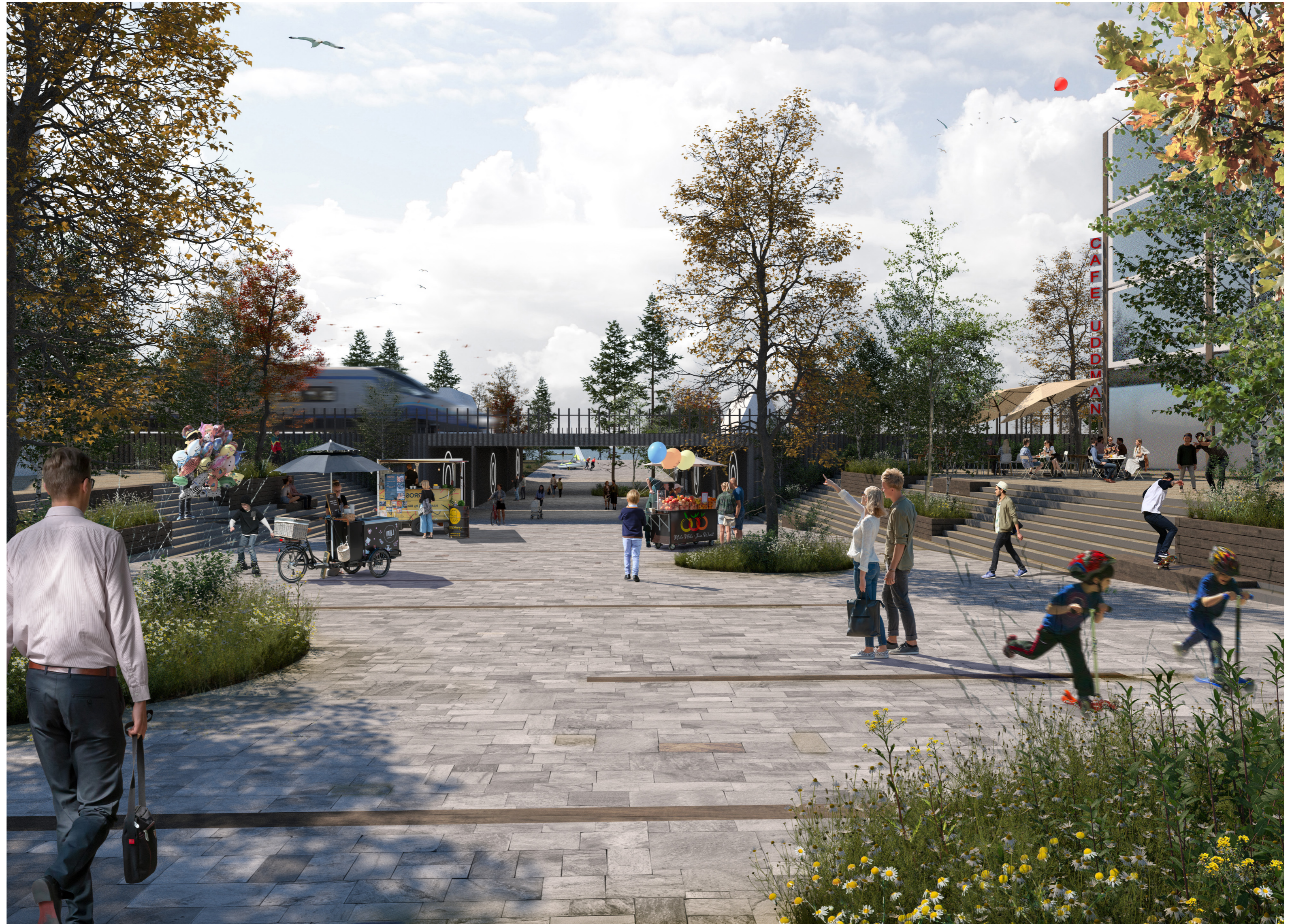
New underground connection transforming Uddmansgatan into a lively urban space that can host markets or serve as an art space. It maintains the important sightline towards the waterfront and links to the new cultural hub and recreational park along Sörfjärden.