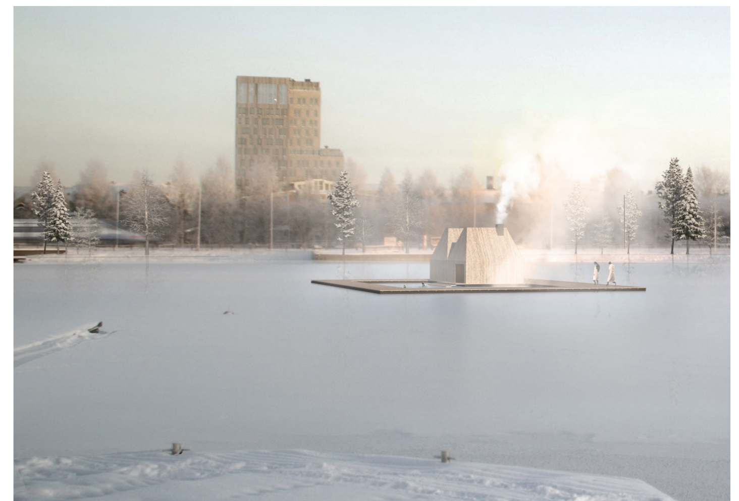
A new sea bath in Sörfjärden gives life to new communities in Piteå and creates contrast to the high speed trains passing by.