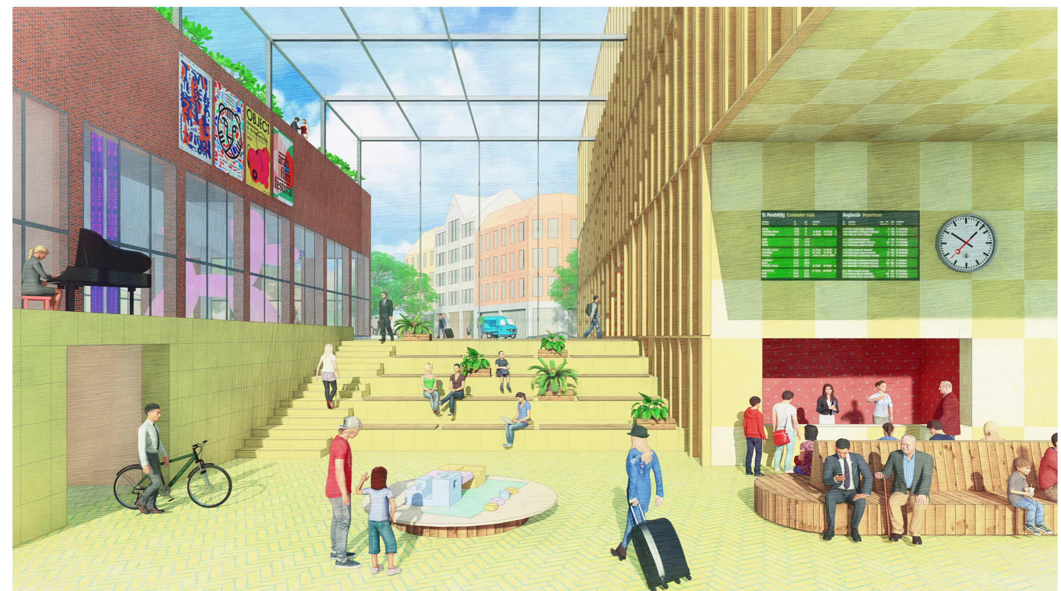
A genuine town hall

The hub combines the characteristic Galten building and a new wooden structure, blending old and new to establish a fresh identity for Rimbo's centre, while honouring the town's history as a rail hub. The generous openings will allow the programme to activate the public space.