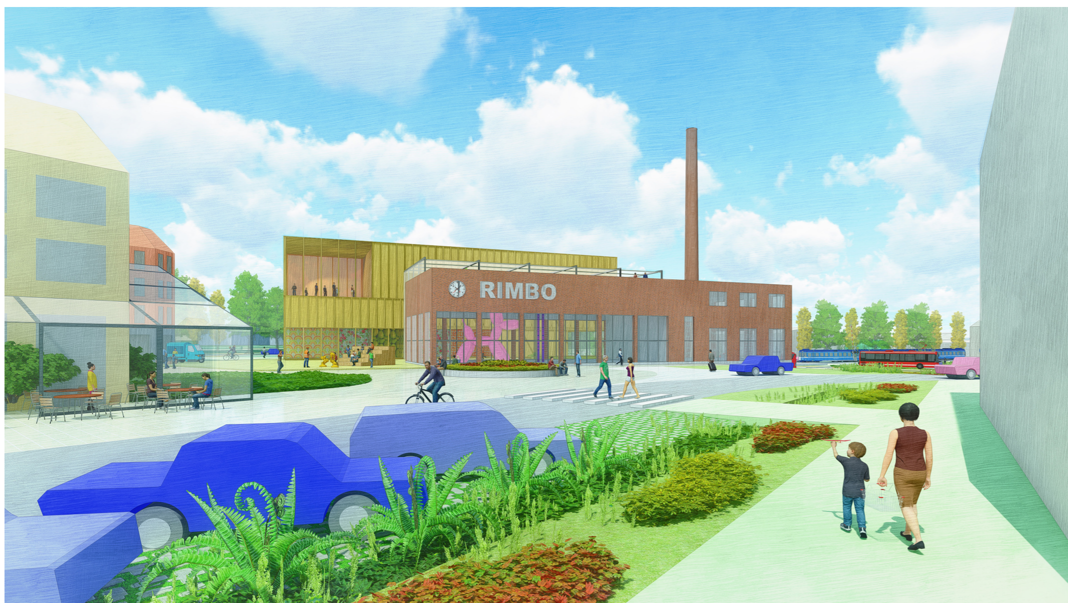
A multifunctional travel centre

The hub combines the characteristic Galten building and a new wooden structure, blending old and new to establish a fresh identity for Rimbo's centre, while honouring the town's history as a rail hub. The generous openings will allow the programme to activate the public space.