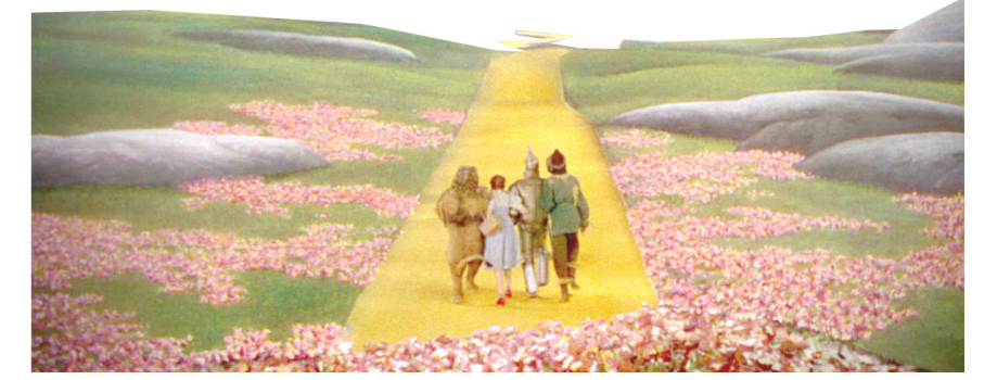
FOLLOW THE YELLOW BRICK ROAD

The main street introduces a continuous urban stream, connecting a diverse collection of public spaces, each with its unique identity. This coherent entity accommodates the fluctuating identities of our contemporary societies. Democracy is equality among the different and, only collectively, can we overcome our greatest challenges.