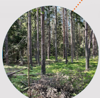
Pine tree forest

Social zone 5m Bikes & pods 5m Forest zone 5m Pedestrians 5m Social zone 5m