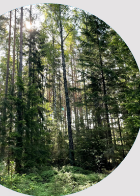
Pine tree forest