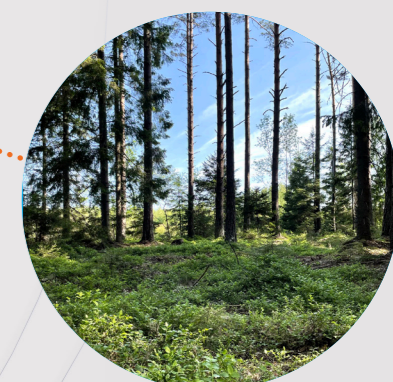
Lush forest floor